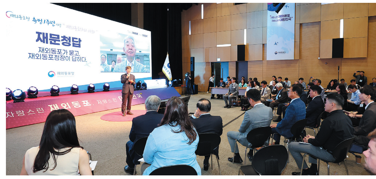
Overseas Koreans and government and related officials listen to a question from an overseas Korean who participated online in the "Dialogue with Overseas Koreans" to mark the first anniversary of the Overseas Koreans Agency.

Special Article 2 - Overseas Koreans Agency celebrates one-year anniversary