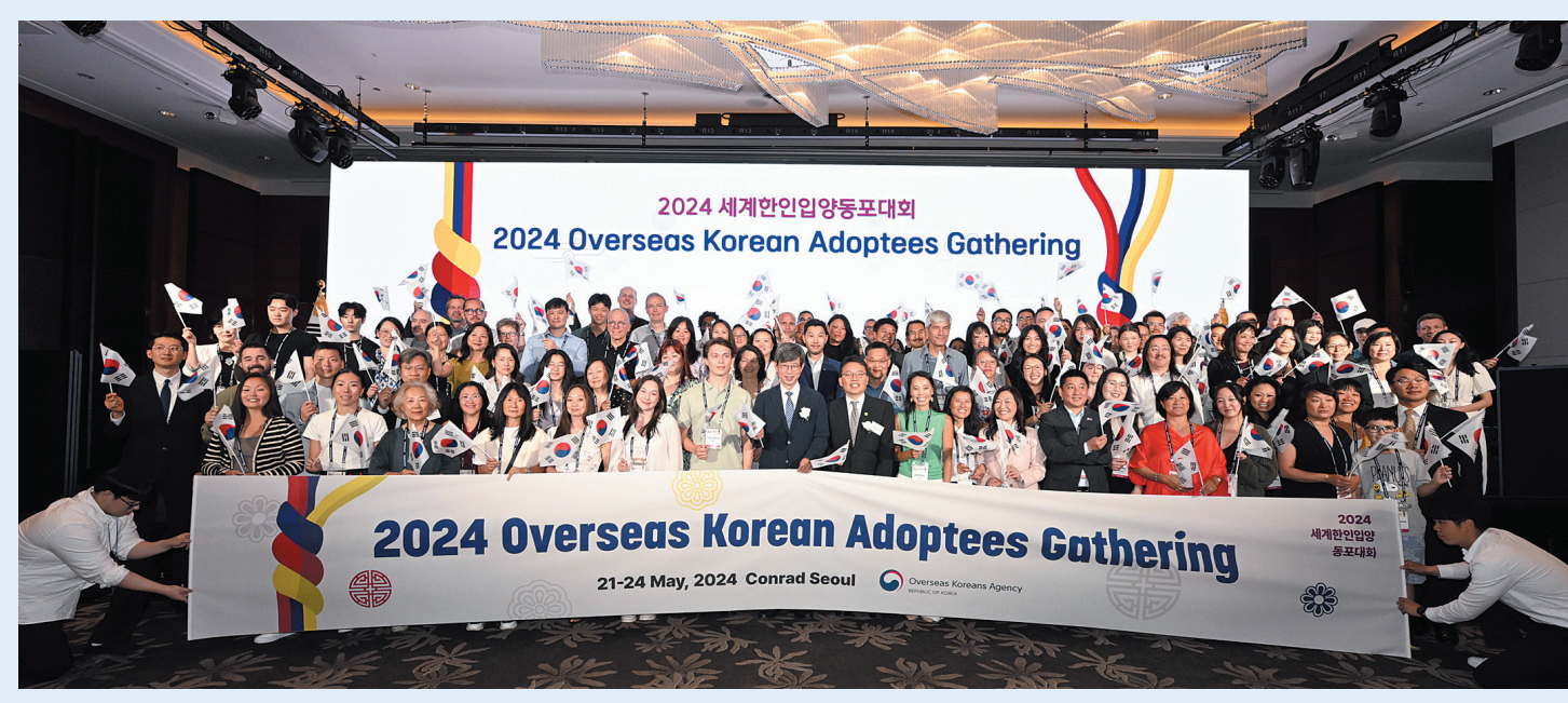
Participants in the 2024 Overseas Korean Adoptees Gathering pose for a group photo at the Conrad Seoul Hotel in Yeongdeungpo-gu, Seoul. The gathering was hosted by the OKA and held from May 21 to 24.

Attention paid at Overseas Korean Adoptees Gathering; adoptees work in helpful organizations and track down their roots