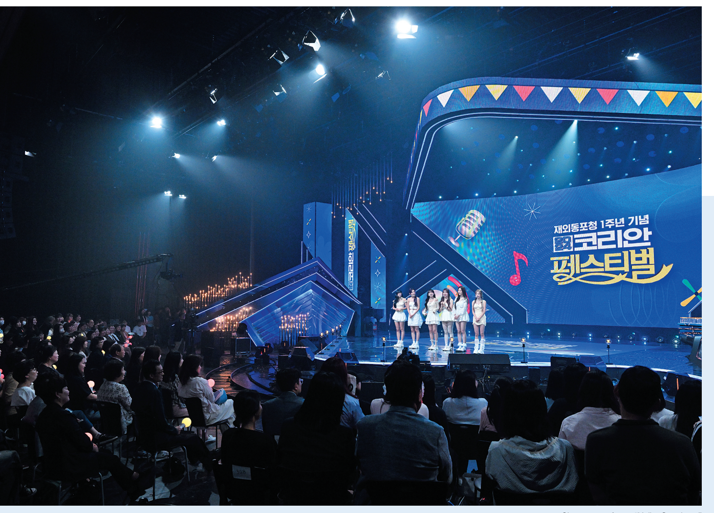
Cignature performs "Hello, Greetings."

color-changing flashlights and occasionally sang and danced along, adding to the excitement.