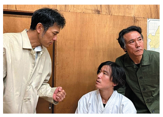
A scene from the play "Hyeonhaetan" staged in Tokyo, Japan