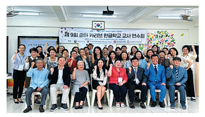
Participants in the Central American Hangeul School Teacher Training Program pose for a photo in Santo Domingo, Dominican Republic.

In addition, the Central American and Caribbean Hangeul School Council signed a business agreement with the International Language Education Department at the Digital Seoul Culture Arts University to