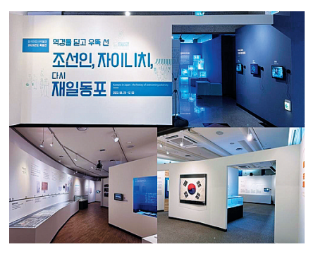
The Museum of Korea Emigration History's "Illumination of Korean-Japanese History Special Exhibition"

Members of the Inner Circle" and "From Koreans to Zainichi," respectively, focus on the history of the Koreans in Japan during the Japanese colonial period and the laying of their roots in Japanese