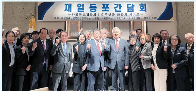
OKA Commissioner Lee Sang-duk (6th from R, first row) takes a commemorative photo with participants at a meeting of overseas Koreans in Tokyo on Nov. 29, 2024.

growth among domestic Korean SMEs and compatriot businesses.