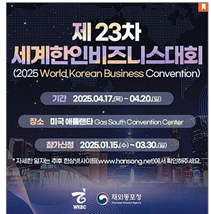
A text message providing information on the 23rd World Korean Business Convention

Through this year's convention, the OKA aims to strengthen regional and sectoral linkages between overseas Korean businesspeople to proactively respond to global economic crises and actively promote exports.