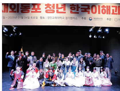
The next generation of Korean Japanese participating in the "Understanding Korea Course for Koreans in Japan" training program

Participants learned Hangeul, made stamps with their names on them and learned Korean music through traditional instruments.