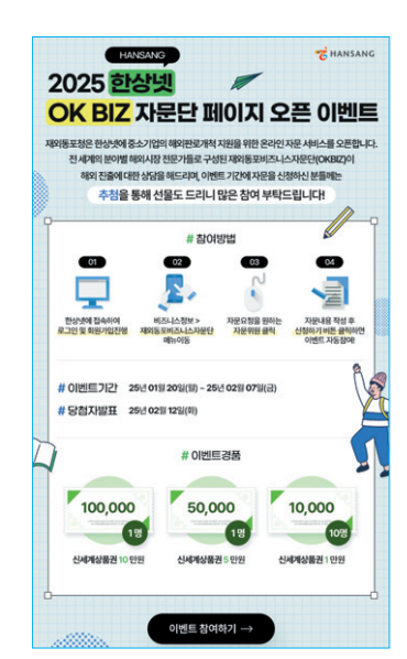
Images related to the launch of Hansang Net's online advisory service

interested domestic company or entrepreneur can access Hansang Net for free and use the advisory service.