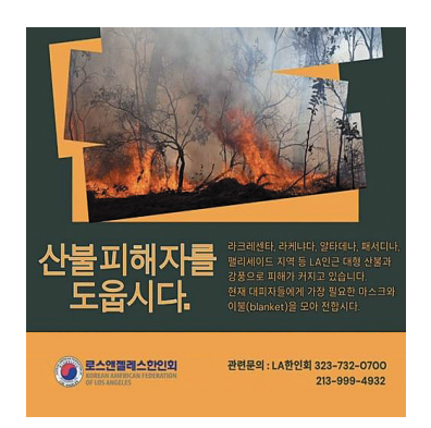
A notice by the Korean American Federation of Los Angeles regarding the collection of supplies to support victims of the Los Angeles wildfires

"The Korean Association has organized a relief drive and delivered 100,000 masks to the affected areas, and other Korean American communities in the region are also sending