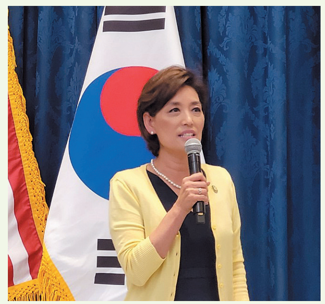
U.S. Rep. Young Kim

The East Asia-Pacific Subcommittee is responsible for the State Department's affairs in the East Asia-Pacific region. Kim previously served in the 118th Congress as chair of the Foreign Affairs