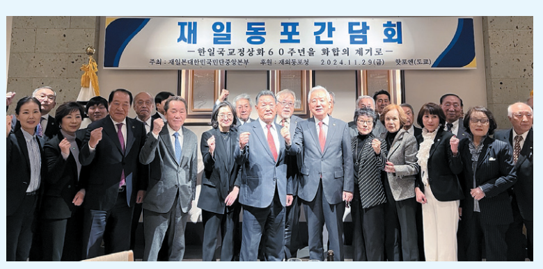
OKA Commissioner Lee Sang-duk (6th from R, first row) takes a commemorative photo with participants at a meeting of overseas Koreans in Tokyo on Nov. 29, 2024.

growth among domestic Korean SMEs and compatriot businesses.