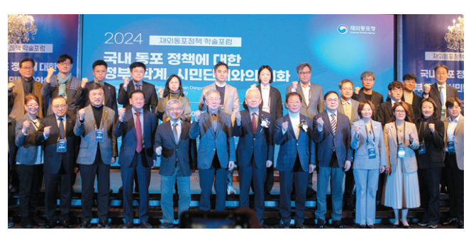
Participants pose for a photo at the Academic Forum on Overseas Korean Policy at the CCMM Building in Yeouido, Seoul, on Dec. 6, 2024.

Meanwhile, on Dec. 6, the agency held an academic forum on overseas Korean policy at the CCMM Building in Yeouido, Seoul,