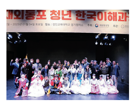
The next generation of Korean Japanese participating in the "Understanding Korea Course for Koreans in Japan" training program

Participants learned Hangeul, made stamps with their names on them and learned Korean music through traditional instruments.