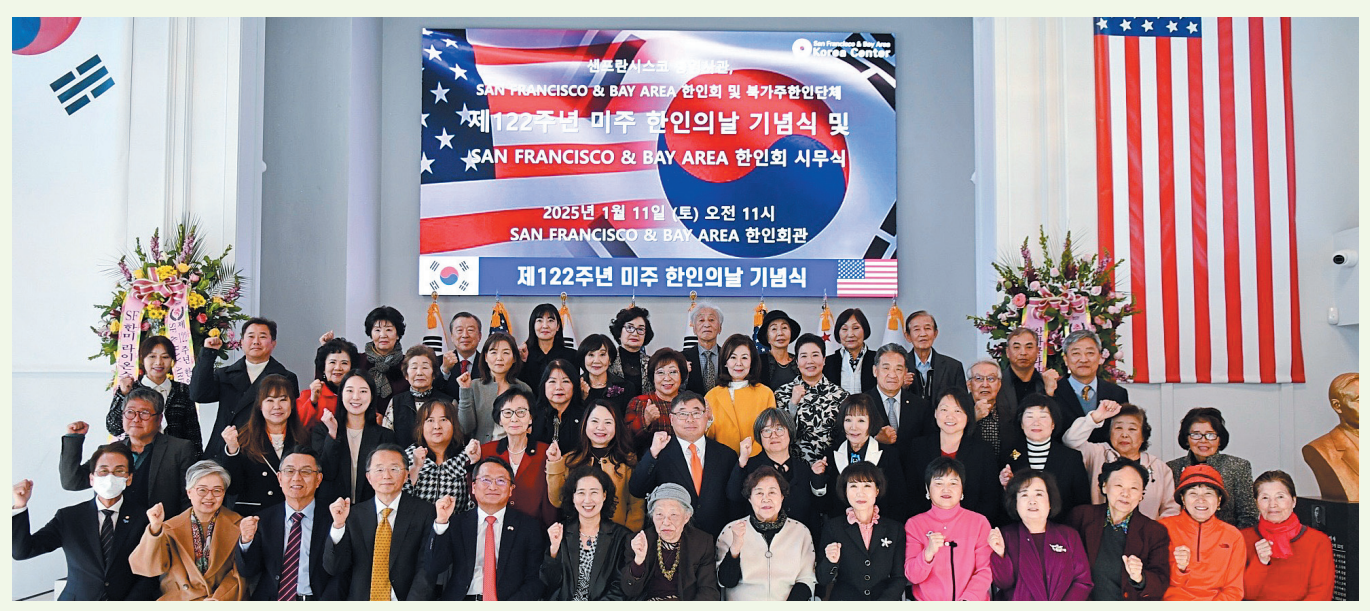
The 122nd anniversary of Korean American Day and the 2025 Korean Association Inauguration Ceremony, co-hosted by the Consulate General of the Republic of Korea in San Francisco, the San Francisco & Bay Area Korea Center and Korean associations in Northern California, is held at the San Francisco & Bay Area Korea Center on Jan. 11.

Maryland governor hosts Korean American Day celebration