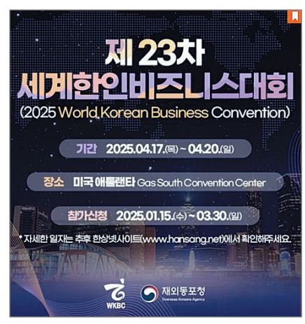
A text message providing information on the 23rd World Korean Rusiness Convention

Through this year's convention, the OKA aims to strengthen regional and sectoral linkages between overseas Korean businesspeople to proactively respond to global economic crises and actively promote exports.