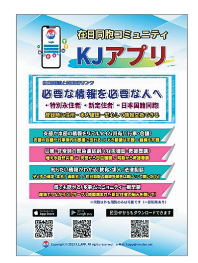
An announcement of the launch of the KJ App, an integrated network for Koreans in Japan

"It is an integrated community app that unites various members of the Korean diaspora, including longstanding settlers who have lived in Japan since the Japanese occupation, new settlers who have come to Japan since the 1980s, naturalized citizens who have acquired Japanese citizenship and Japanese who are interested in Korea," said a Mindan official, adding, "It will serve as a place for exchanges and harmony in the Korean-Japanese community."