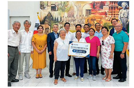
Members of the Korean Association of Mexico pose for a photo after presenting a donation of 140,000 pesos to the Korean American Museum in Mérida, Yucatán, on Aug. 12.

The Korean Immigration History Museum, located at 397A Calle 65, Centro, Mérida, is a symbolic site that traces the 118-year history of Korean immigration in Yucátan,