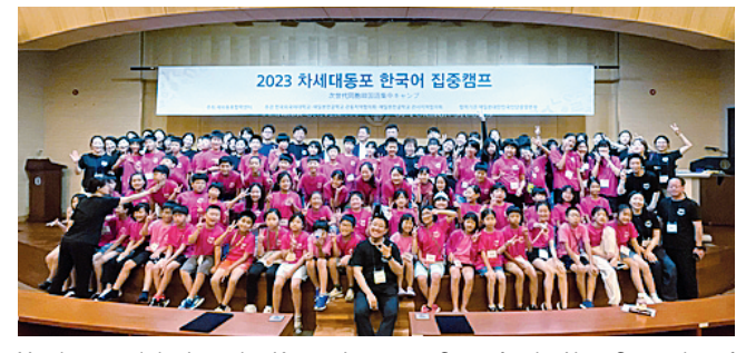
Youths attend the Intensive Korean Language Camp for the Next Generation of Koreans in Japan, hosted by the Overseas Korean Cooperation Center.

"We hope that the next generation of Koreans in Japan will feel