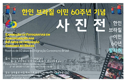
A poster for the Korean Association of Brazil's photo exhibition in São Paulo, commemorating the 60th anniversary of Korean immigration to the South American country

agriculture, the Korean community has spread to various fields, including commerce and manufacturing, and Bom Retiro in São Paulo's commercial center has been designated as the Koreatown.