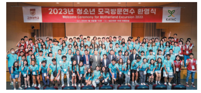
Participants of the 2023 Overseas Korean Friends Homecoming Teens Camp pose for a group photo at the opening ceremony at Cheonan Independence Hall on Aug. 7.

Starting with an opening ceremony at the Cheonan Independence Hall, the participants took part in a week of activities, including watching Andong Hahoetal and K-pop performances, visiting traditional markets and exploring historical sites, such as Hwaseong in Suwon, Gyeongbok Palace and the Hanok Village in the heart of